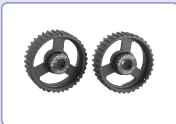
Oil Pump Pulleys - 8mm