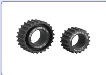
Crank Pulleys - 8mm